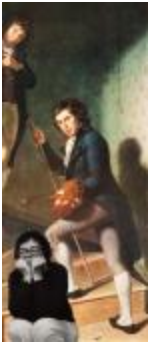
Staircase Group - Charles Wilson Peale, from the series 'Cutouts'