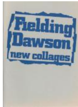
Fielding Dawson Fielding Dawson New Collages, 1978