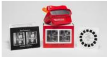
Jim Pomeroy Jim Pomeroy 3-D Viewmaster Viewer, 1988