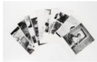
John Collier;Jack (Jacob Ovcharov) Delano FSA Postcard Set, 1982