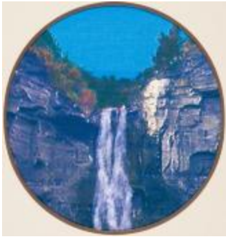
Taughannock Falls, from the series Fac-Similes